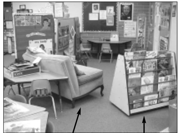
Comfortable reading spot