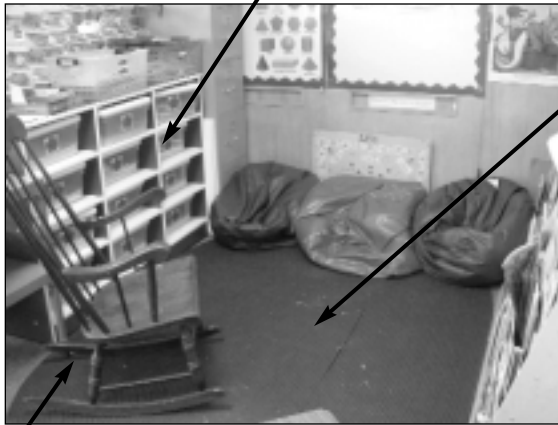
Library situated in a corner away from traffic flow